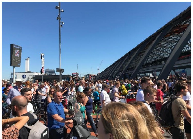
Amsterdam – mobility interchange

One such mobilities is the movement of tourists . Attracting growing numbers of leisure-motivated city users, accommodating them, feeding them and moving them around sites of interest is, per se, a demanding task for urban planning and management. Yet this is even more problematic in a time when visitor practices 'on the move' take over the assets and spaces that form part of the citizens' everyday , like homes, public space, transport services, markets and neighbourhood shops, sports facilities, bike lanes .... This trend has been progressively reinforced by digital technologies like portable devices and social networks, which act as facilitators of local connections and navigation, abating the cognitive barriers that traditionally kept the life-sphere of tourists separated from that of residents. Aside from the huge environmental challenge that leisure-driven mobilities pose at a global scale and its local repercussions, local communities all over Europe today feel that tourist activity, until recently regarded as a source of prosperity and pride for, is turning into a threat for their way of life.