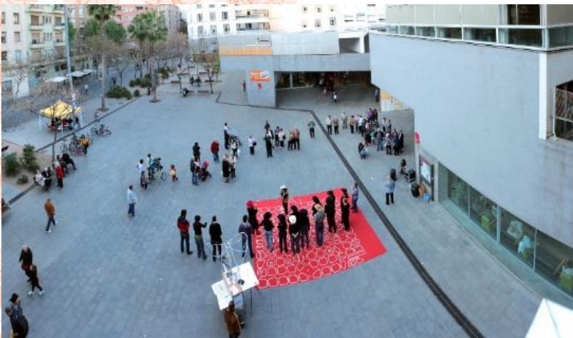
Barcelona – Citizens' participation initiative

In a last stage of the research process, social and other stakeholders in each case study city are invited to take part in a participatory process aiming at elaborating solutions in the face of social exclusionary processes produced by tourism-related motilities, scaling up small-scale coping tactics to social and policy innovation. Such solutions may include innovative social arrangements, mediated or not by smart technology (as in the circular or collaborative economy), as well as planning and management innovations. Ultimately, we'll be looking to draw on collective intelligence and everyday experience to define urban models that are inclusive, gendered, just, and accomplish a shift towards cities that are more socially resilient in the face of the interventions of tourism mobilities.