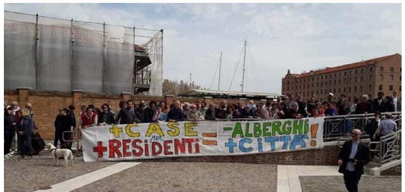
Venice – Citizens protest against new hotels (OCIO Facebook page)

In this way we obtain a European map that classifies regions and metropolitan in terms of mobility drivers, pull factors, and forms of social exclusion . Due attention is paid to socioeconomic regimes, geographical and geopolitical diversity, or social capital as potential mitigating or boosting factors of such effects. Out of this initial pan-European analysis, the project identifies issues and situations